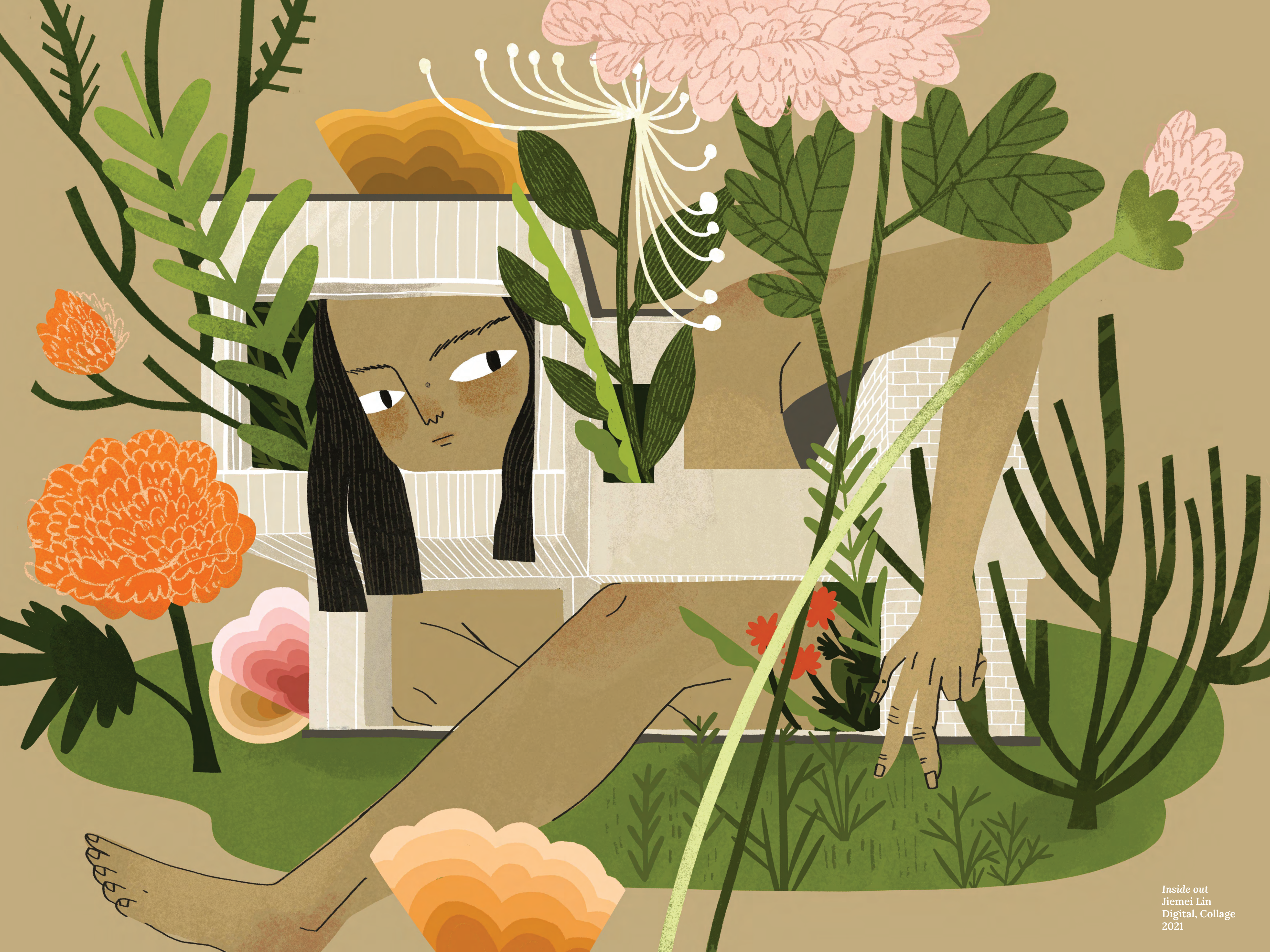
Inside out Jiemei Lin Digital, Collage 2021