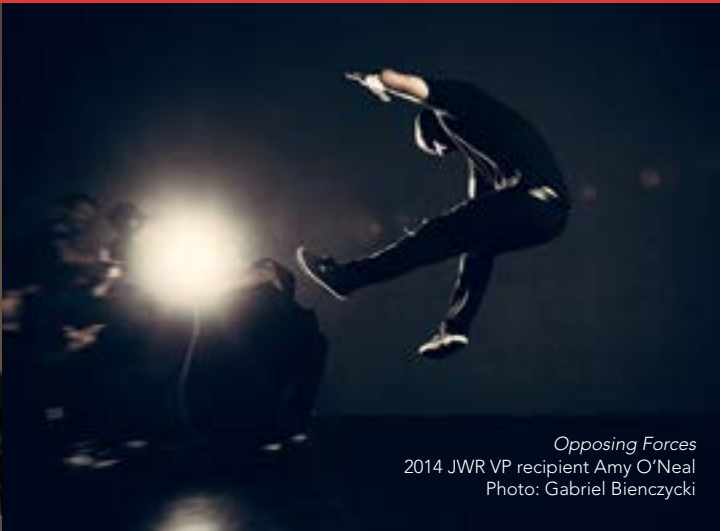
Opposing Forces 2014 JWR VP recipient Amy O'Neal

DEADLINE: August 7, 2017 Applications must be submitted by midnight PST.