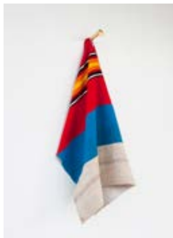
FIN (The End of the Line) 2016 JWR VP recipient Juventino Aranda